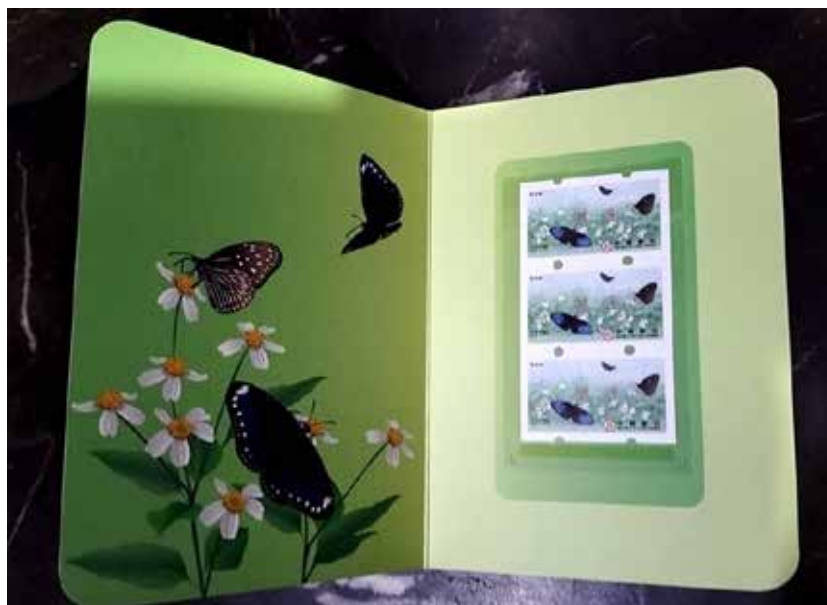
Fig 7 "Purple Spotted Butterfly" ATM stamps

Chunghwa Post issued commemorative folders, brochures, stamp souvenir sheets, first day covers, and related merchandise to coincide with the daily themes of the event, as well as a wide range of souvenir products for the show, including "Purple Spotted Butterfly" ATM stamps (Fig. 7), and a dedicated instructor, Prof. Ho, was present at the exhibition area every day to explain the exhibits and provide guided tours.