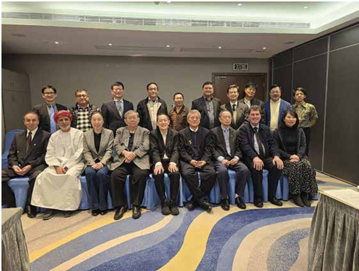
↑ Group Photo