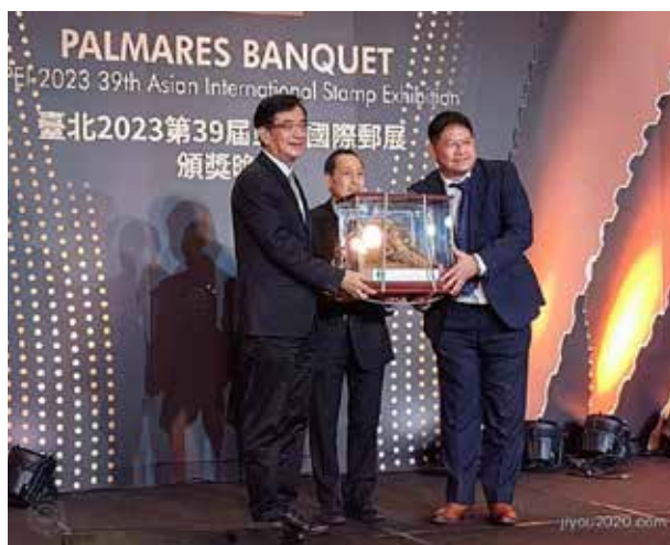
↓ Fig 11 Handing over the flag of the FIAP Asian Philatelic Federation to the next host country, Thailand.