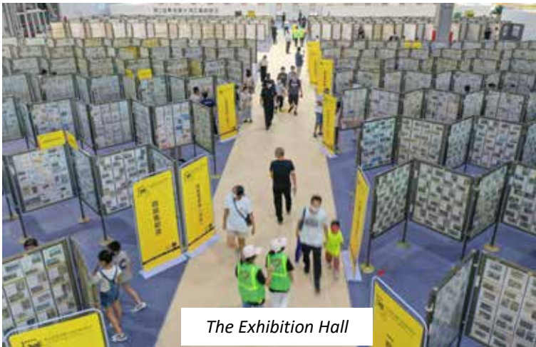
The Exhibition Hall