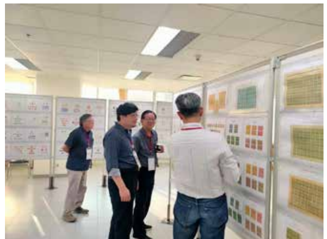
Participants judging during day 2