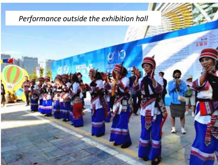
Performance outside the exhibition hall