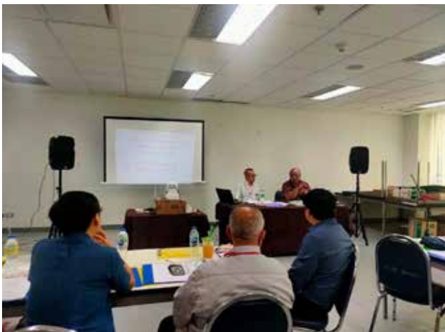
Jury Academy training Day 1

Day 2 is the practical session. The participants, divided into four teams, took turn in judging three Traditional Philately class and one Postal History class exhibit. The points given to each judging criteria was discussed and comments made about the results. Another objective of the practical session was how to give good feedback to exhibitors. It was conducted by role playing with one member of the team acting as “exhibitor” and others in the team acting as “judges”. The “judges” practiced how to advice to the “exhibitor” as to how the exhibit could have been improved. All participants found the practical session extremely useful. Last item of the agenda was personal interview with the trainer regarding expectations and ways to improve the training exercise in future.