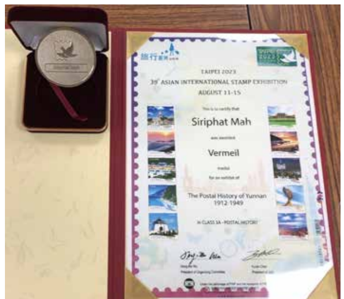
Figure 4 shows the medals and certificate of the TAIPEI 2023-39th Asian International Stamp Exhibition, which are designed with personalized stamps and are quite distinctive.