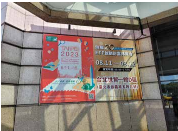
Fig 1 TAIPEI 2023 – 39 TH Asian International Stamp Exhibition

Sponsored by the FIAP Asian Philatelic Federation and endorsed by the FIP International Philatelic Federation, TAIPEI 2023-39th Asian International Stamp Exhibition (Fig. 1) was held in Hall 1 of the Taipei World Trade Centre from 11 August to 15 August 2023, with the theme of "Wandering in the Stamp World" as its grand opening. Originally scheduled for 2020, the exhibition was postponed to this year due to the impact of the global pandemic of COVID-19. There were 14 categories of competitive exhibits, with 26 FIAP member countries and areas taking part in the event, some 227 philatelic collections and 1,050 frames on display, and 41 literature exhibits. In addition, 89 postal agencies and philatelic companies from all over the world set up booths to promote the culture of philately through the charm of diversity and inclusiveness (Fig. 2).