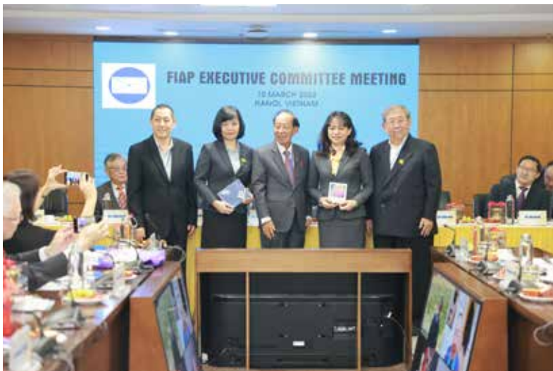
Gift exchange was presented followed by group photo.