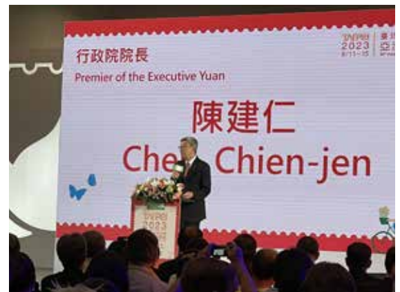
Fig 6 Mr Chien-Jen Chen, Vice President of the Republic of China delivered a speech