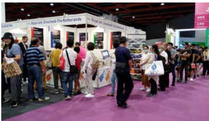
Fig 5 Stamp Vendor's booth and visitors

The exhibition area is very spacious and divided into six major areas. At the entrance, Chunghwa Post has set up a service counter, where postal passports were issued to the public when they entered the exhibition area, so that they could have their passport cancelled at the booths of various countries. On the left side of the main corridor was the Philatelic Gem exhibition area invited by FIAP Grand Prix Club, where the abovementioned world's rarest stamps, the "British Guyana One-Cent Magenta", was on display. There was also a philatelic literature exhibition area beside. Further on, there was a bustling area of stamp vendors' booths, which was always crowded with people (Fig. 5). In addition to a wide range of stamps on display, the venue also features an immersive theme area.