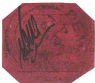
← Fig 3 The British Guyana One-Cent Magenta

The most notable feature of the exhibition was the Philatelic Gem Pavilion, where a number of precious stamps and covers were on display, including one of the rarest stamps in the world, the "The British Guyana One-Cent Magenta" (Fig. 3), which was exhibited for the first time in the Asian region of Taipei, and was the world's most expensive single stamp, valued at NT$260 million (by Stanley Gibbons Ltd.). This exhibit attracted a queue of people lining up to view the stamp during the five-day period, which demonstrated the amazing appeal of the precious stamps.