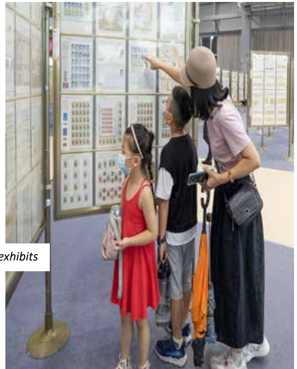
Viewing the exhibits